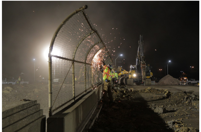
Demolition of the Chene Street bridge.

The advanced bridges project is MDOT's effort to reconstruct 18 bridges along the I-94 corridor in Detroit that are in the poorest condition. After closing the freeway to traffic over the weekend of March 16, project contractor C.A. Hull demolished Chene Street bridge and half of the Gratiot Avenue structure. (Chene Street bridge traffic is currently detoured to the Mt. Elliott Street bridge, while traffic is being maintained on the remaining half of the Gratiot Avenue structure.)